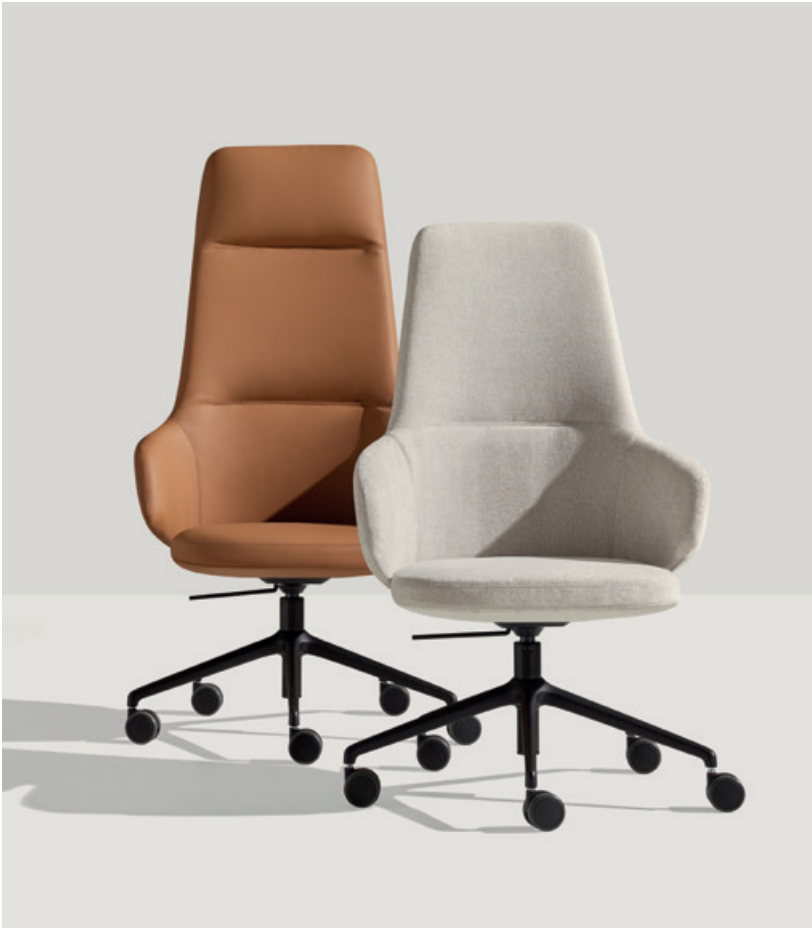
— The armchairs are available in all versions with two backrest heights, medium and high.