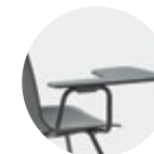
Detachable arm with writing tablet (right/left) Only suitable for chairs with 4 leg frame on casters VAR0038 - VAR0039 certificate+