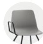
Detachable arm (right/left) Only suitable for chairs with 4 leg frame on casters VAR0036 - VAR0037 certificate+