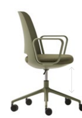
Swivel with gas lift. Swivel base on casters. Seat height adjustment with gas lift.