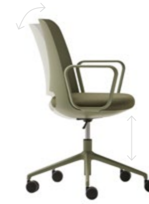
Tilt mechanism. Swivel base on casters. Seat height adjustment with gas lift. Tilt activation or locking in work position.