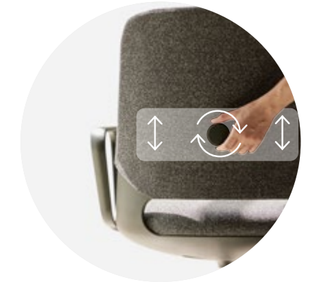
Adjust the height of the backrest support by simply turning the lumbar support knob.